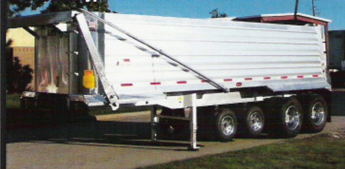
Frame-type with WAVE sidewalls

Travis Body & Trailer, Inc. 13955 FM 529 * Houston, TX 77041 800.535.4372 or 713.466.5888 www.travistrailers.com