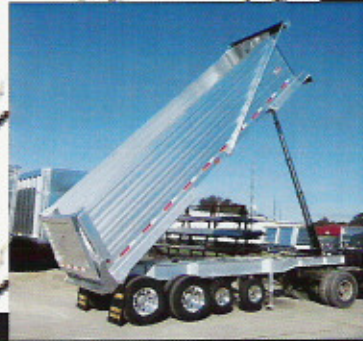
Frameless with AERO-LITE sidewalls